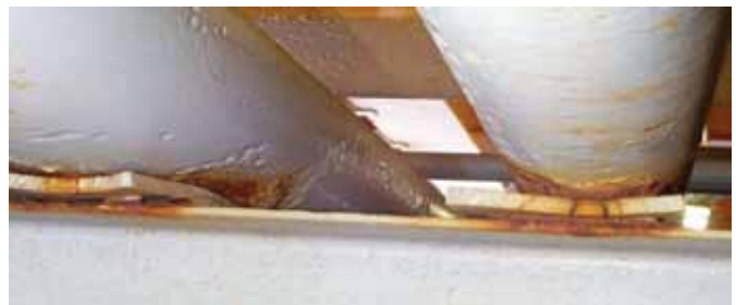
Example of severe topside crevice corrosion under supports on offshore platforms in the Gulf of Mexico. High relative humidity and warm temperatures year-round contribute to the accelerated corrosion.

can amplify costs significantly for large projects, while under conservatism can achieve short-term project cost goals but create long-term headaches, especially in terms of changes in risk perception, fluid corrosivity, chemical inhibitor economics, loss of efficiency, excursions, etc., over the asset’s full life cycle.