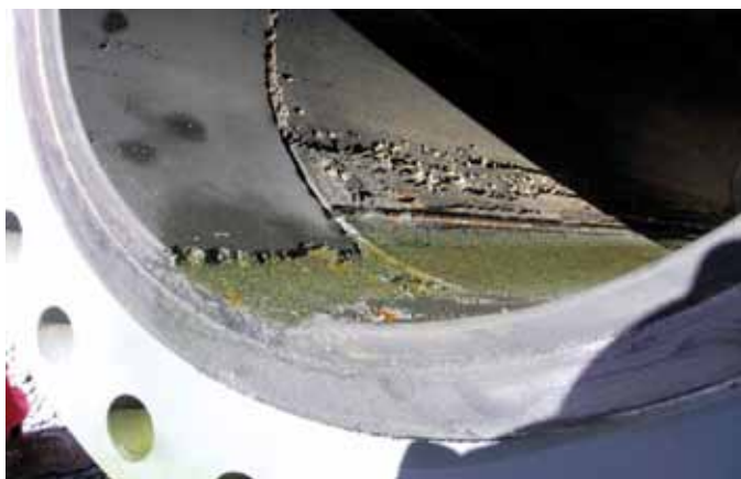
Shown is an example of localized corrosion observed in pipelines caused by sweet ( \text{CO}_2 ) corrosion. Copyright 2009 OTC, reproduced with permission.

An adapted Swiss cheese analogy illustrates the interactions of macro and micro events on the path to failure. Copyright 2009 OTC, reproduced with permission.