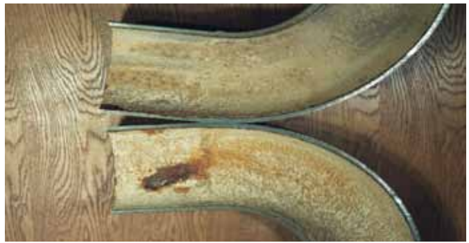
Shown is a failed manifold on a fixed platform due to an isolated erosion defect.

Pipeline CS is the most widely used material of choice because the industry has significant knowledge and experience associated with it, and it is cost efficient at the fabrication stage. But, Singh points out, such steels are also the most susceptible to corrosion, especially when exposed to seawater, reservoir fluids, and production fluids. If systems are going to be too corrosive, he says, then other, more exotic materials need to be considered, such as the CRAs (stainless steels, duplex, and nickel alloys). Using a more corrosion-resistant material, however, can increase initial project costs to anywhere from three to 10 times higher than the cost of using CS. The use of CRAs for cladding or lining within segments of subsea infrastructure, such as high-temperature portions, flexible risers, or jumpers, is often justifiable. “It’s a balancing act,” says Singh, explaining that over conservatism